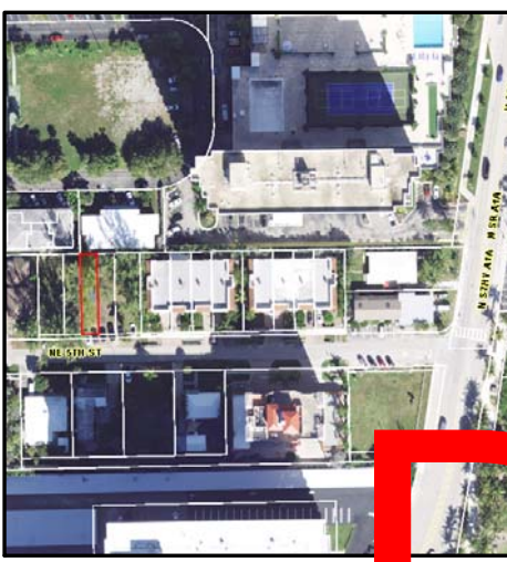
AERIAL MAP (NOT TO SCALE)

FLOOD ZONE INFORMATION Community No. 120055 Panel No. 0377 Suffix: L FIRM Date: 09-11-2009 Flood Zone: AE + 5'